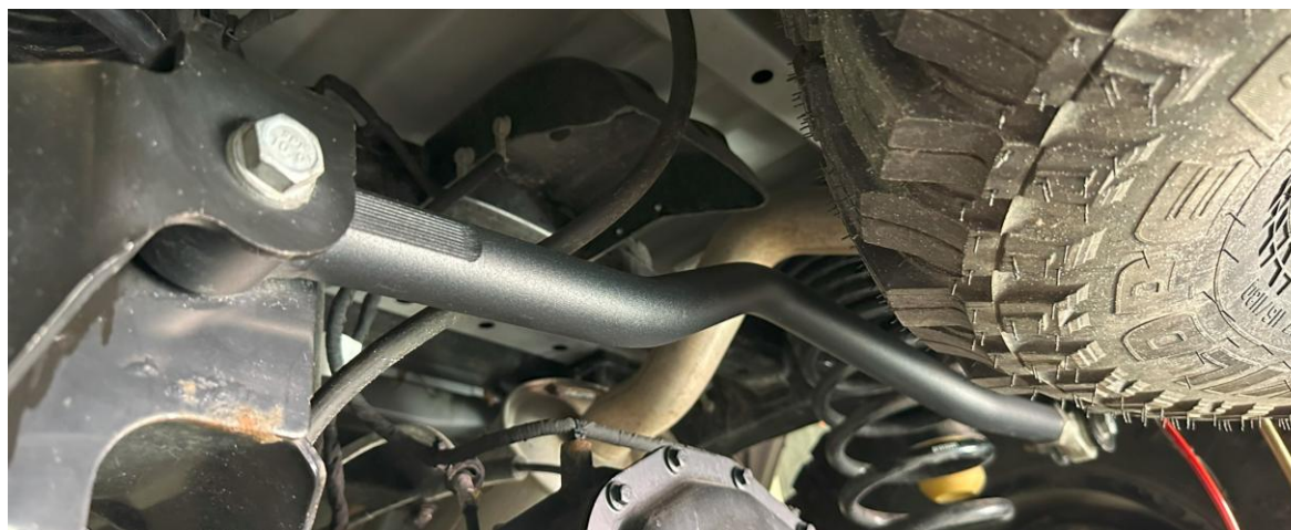
JT adjustable rear track bar bolt installed hand-tight (axle-end)

TIP: If the non-adjustable end does not line up with the mount, have another person push the body of the vehicle back and forth until you can insert the bolt.