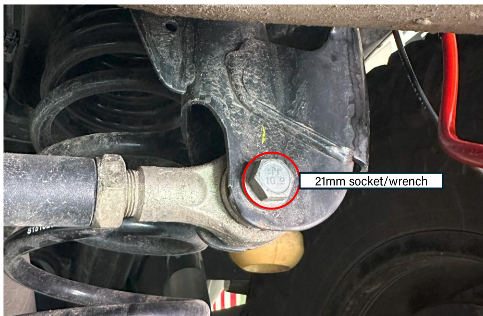
Frame-side rear track bar bolt to be removed