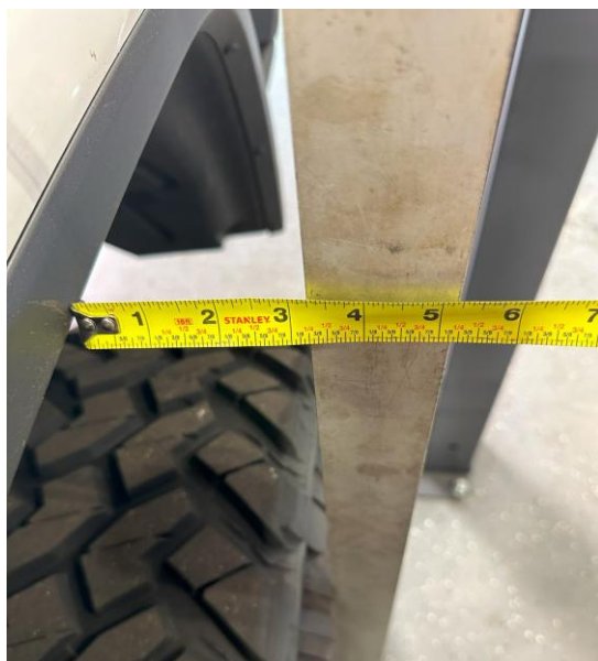
Axle track (driver side) of Jeep JT

If adjustments need to be made, remove the frame-end bolt and shorten or lengthen the track bar as needed.