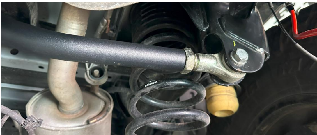
JT adjustable rear track bar bolt installed hand-tight (frame-end)