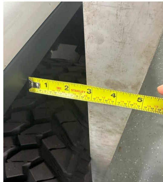
Axle track (passenger side) of Jeep JT

In the case above, the axle was shifted to the driver's side nearly ½" more than the passenger's side.