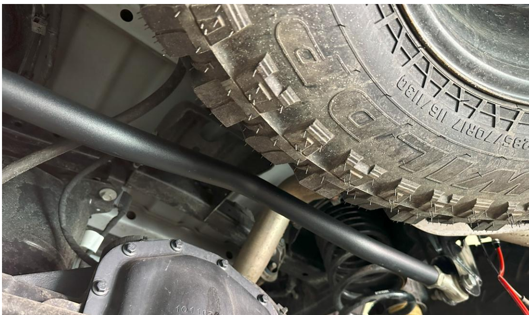
JT adjustable track bar with 37" tire