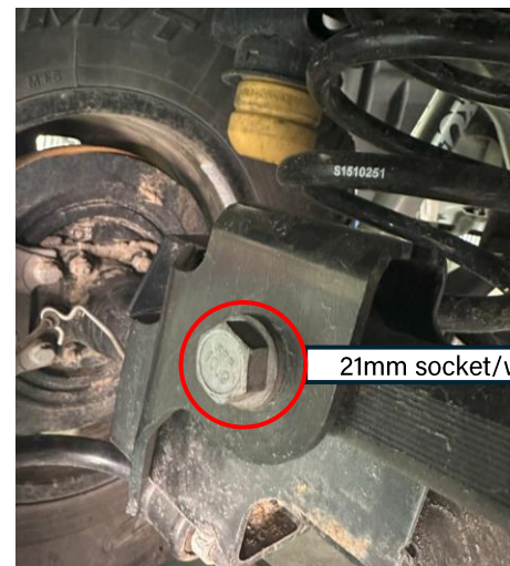
Jeep JT on four-post lift for installation and axle-side rear track bar bolt to be removed