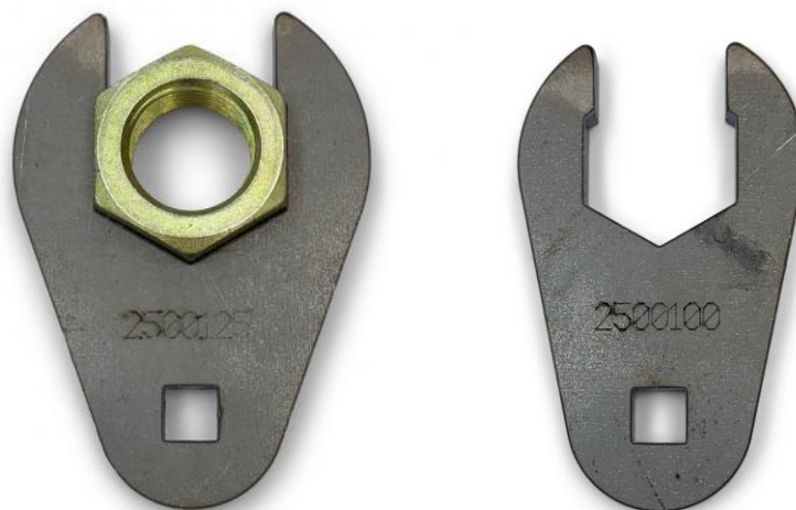
COR Wrench-ends for control arm jam nuts (COR-2500125, COR-2500100)

Please note that not all wrenches are created with the same tolerances. If your wrenches are too loose around the jam nut, Clayton Off Road offers tight, wrap-around wrenches for purchase. Please search for the wrenches using the SKU's below.